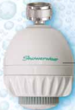
Deluxe Showerwise Multi-Jet Adjustable Massage Head